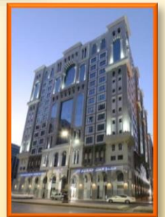
Millennium Al Aqeeq Madinah