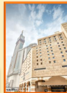
Makarem Ajyad Makkah