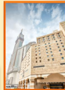
Makarem Ajjad Makkah