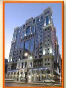
Millennium Al Aqeeq Madinah